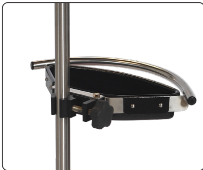
Option - Handle & Tray Insert

† 75 lbs max applied at 6" off center. ‡ 95 lbs max total pumps and bags.